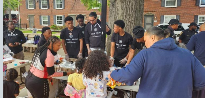
Apprentices passing out food at an Alexandria Police Department community cookout