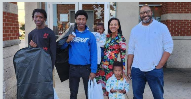
Two apprentices standing with future Mayor of Alexandria, Alyia Gaskins before the NAACP Gala