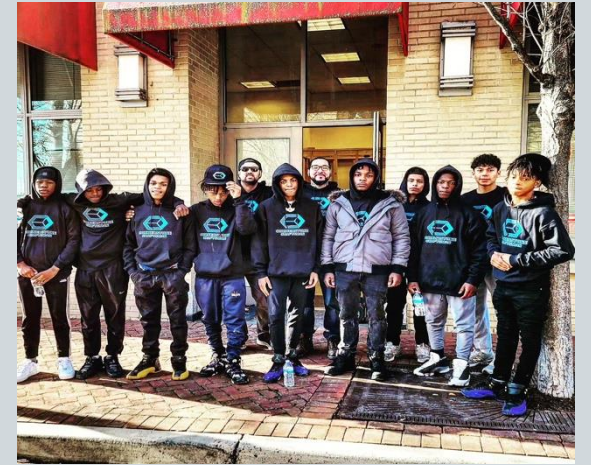
Group photo after training session