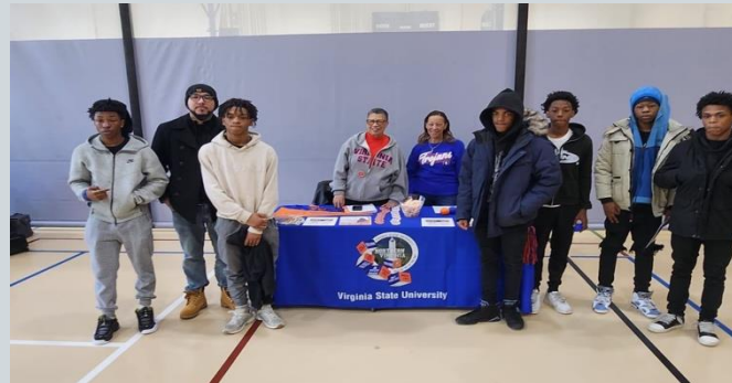
Apprentice students attending an HBCU college fair